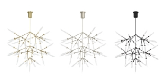
Frost/Aged Brass Frost/Satin Nickel Frost/Matte Black