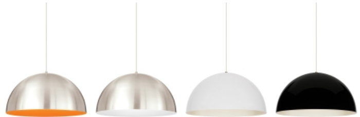
Satin Nickel/Sunrise Orange

Rated for (1) 150 watt max E26 medium base lamp (Lamp Not Included). LED includes 12 watt 1114.5 total delivered lumens, 3000K medium base LED G40 lamp. Fixture provided with six feet of field cuttable satin cable. Dimmable with most LED compatible ELV and TRIAC dimmers.