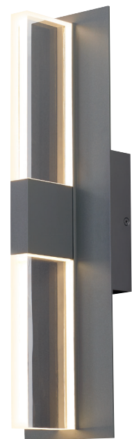
LYFT 18 shown with clear lens, charcoal