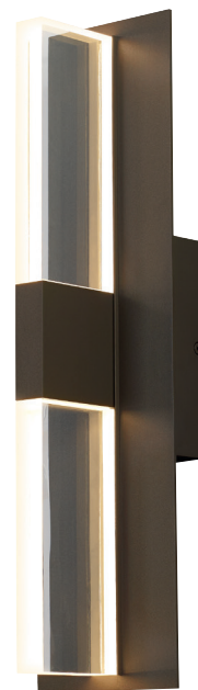
LYFT 18 shown with clear lens, bronze

* Visit techlighting.com for specific warranty limitations and details.