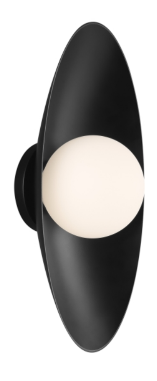
Matte Black/Matte Black Side View