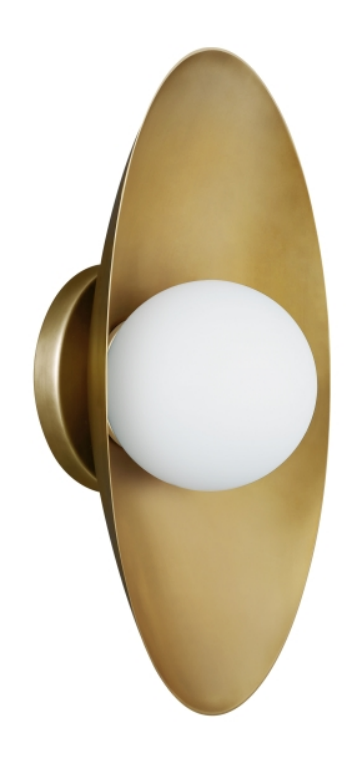
Aged Brass Side View