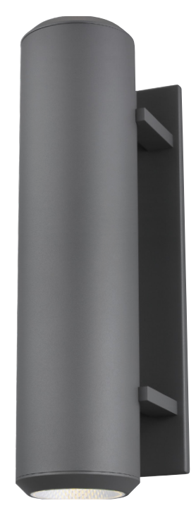
ASPENTI 20 shown in charcoal

* Visit techlighting.com for specific warranty limitations and details.