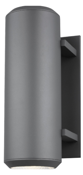
ASPENTI 14 shown in charcoal